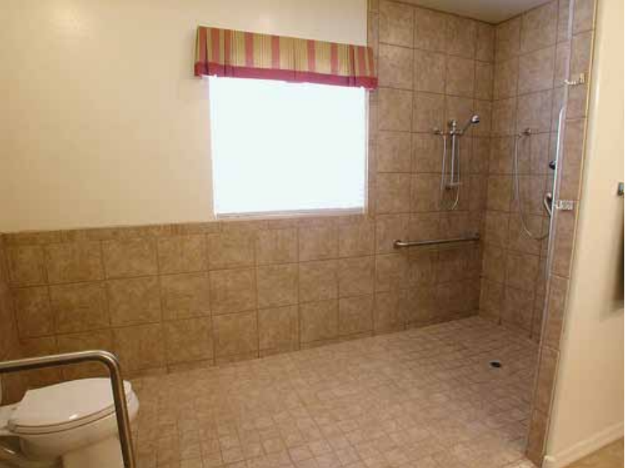
Doorless & stepless shower with non-slip tile and open turning area.