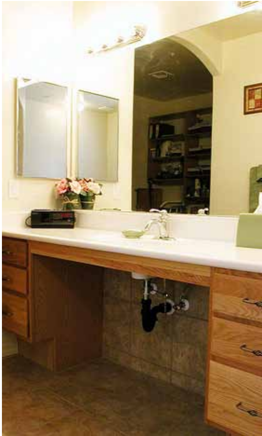
Lowered, open vanity sink.