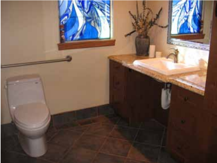
Comfort height toilet, decorative bars, additional lighting and open turning areas.