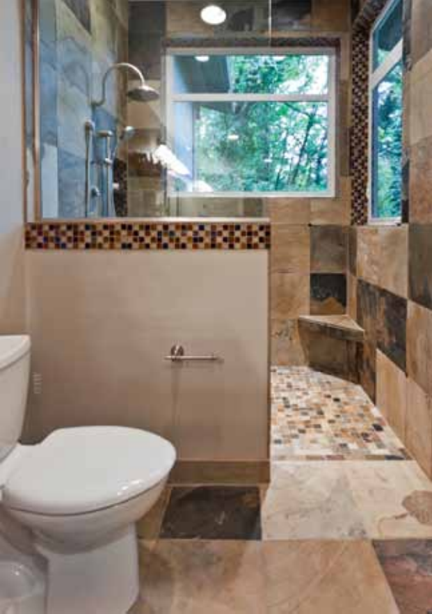
Doorless & stepless shower entry with non-slip slate floor.