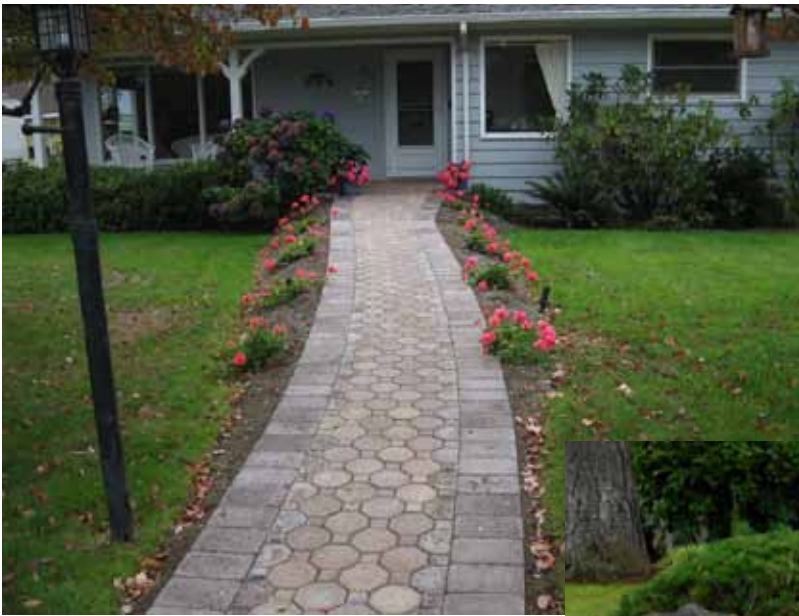
Stepless entries paving styles.