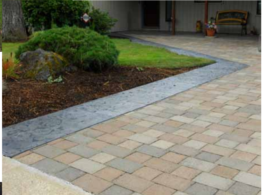
Functional & decorative entries with gradual inclines.