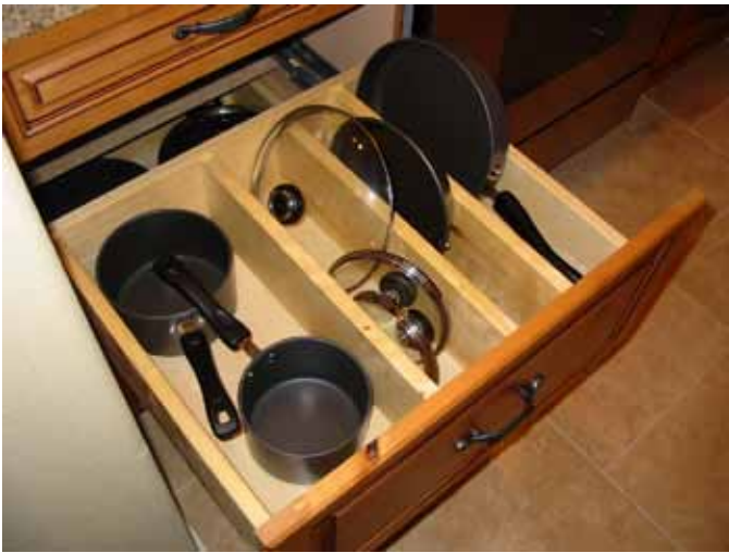
Cabinets redesigned to put heavy pots and pans within easy reach