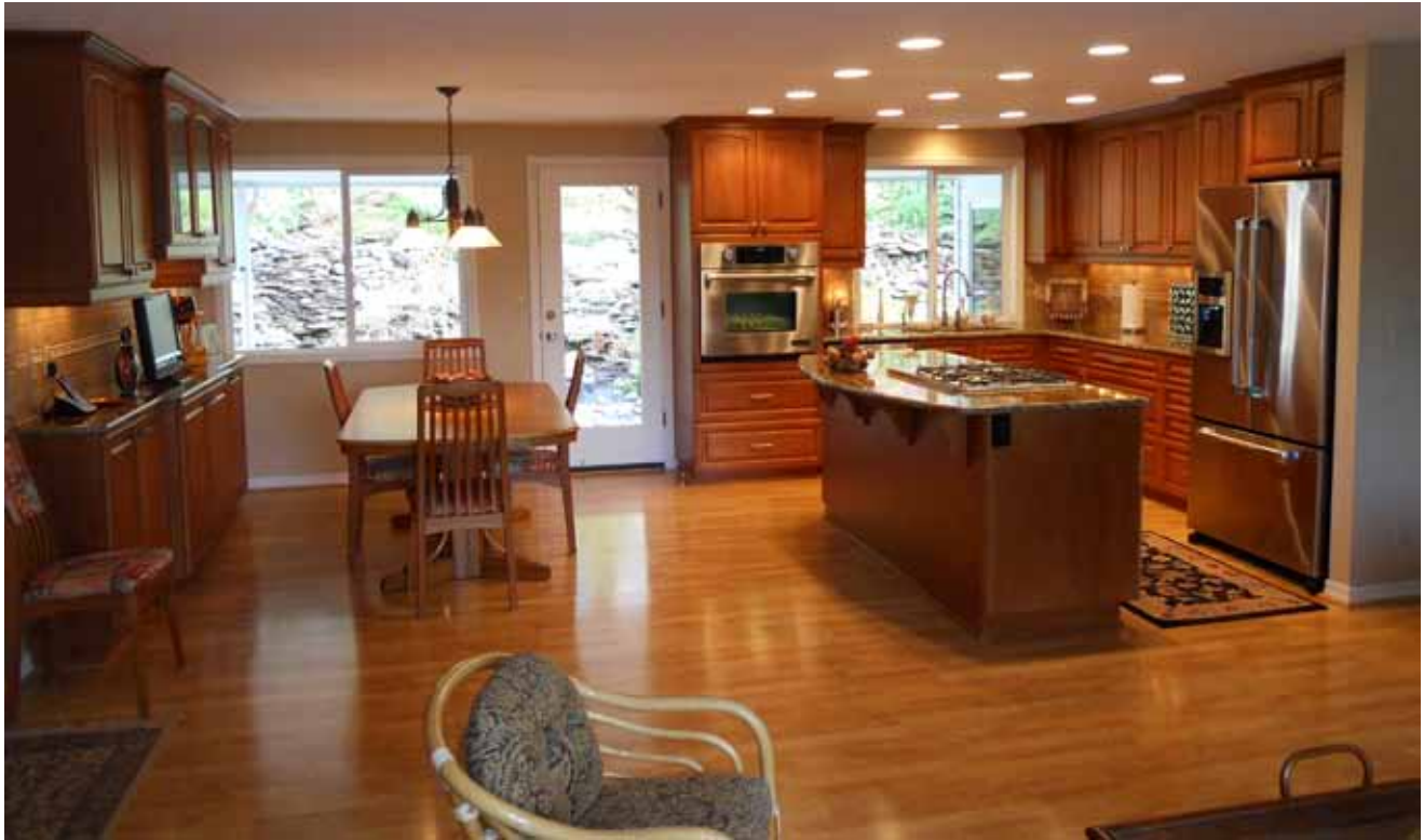
Trip hazards removed and wood floor installed for wheelchair, all appliances with lever handles and lots of lighting for owner with reduced vision