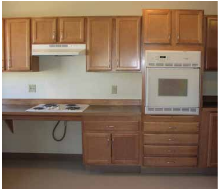
Economy all access kitchen